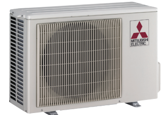
Outdoor Unit: MUY-A15NA